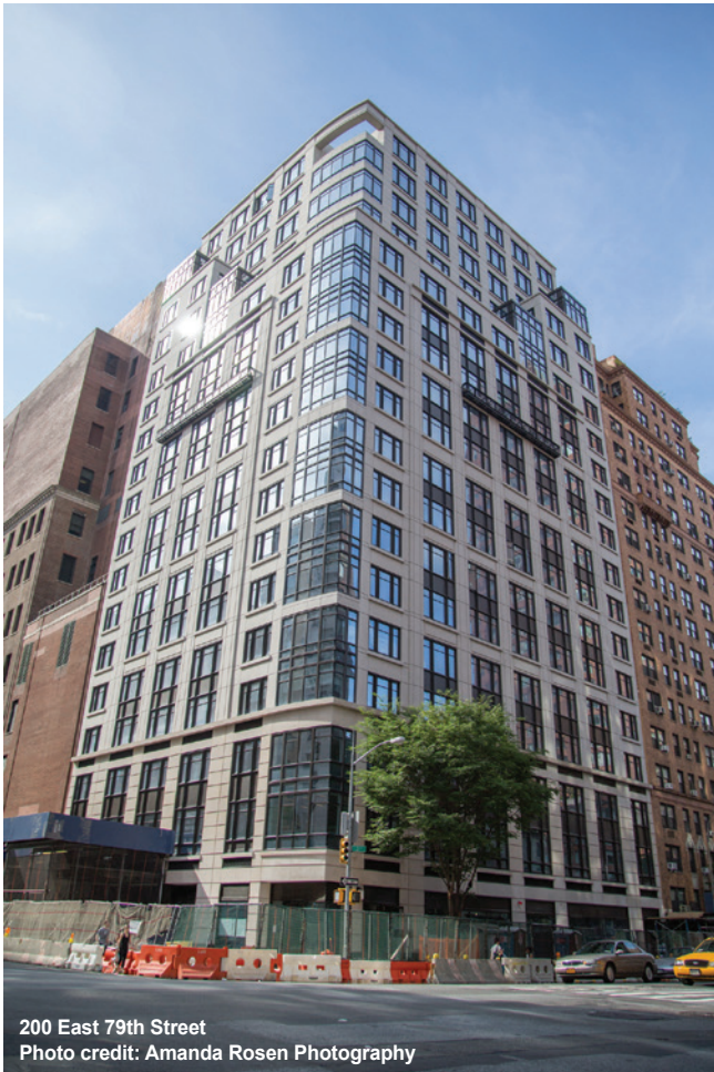
200 East 79th Street